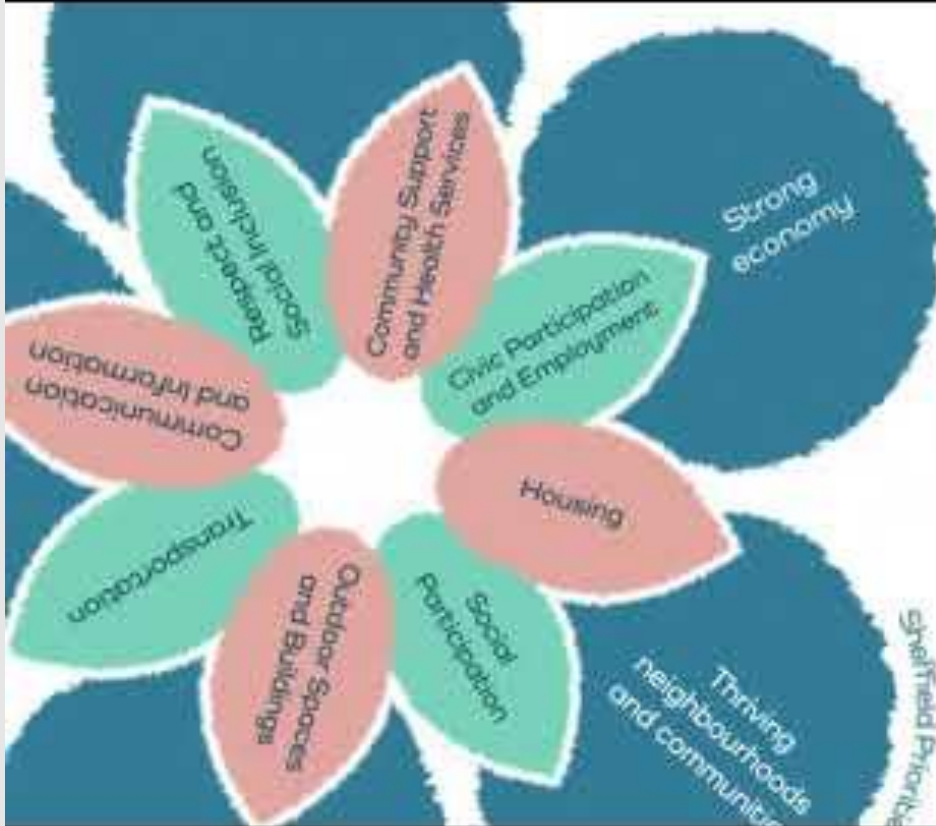
Sheffield priorities animated infographic